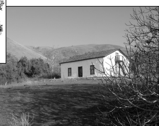
Rancho Higuera State Park HALS CA-10