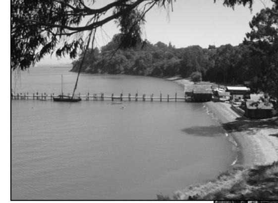
China Camp State Park HALS CA-13